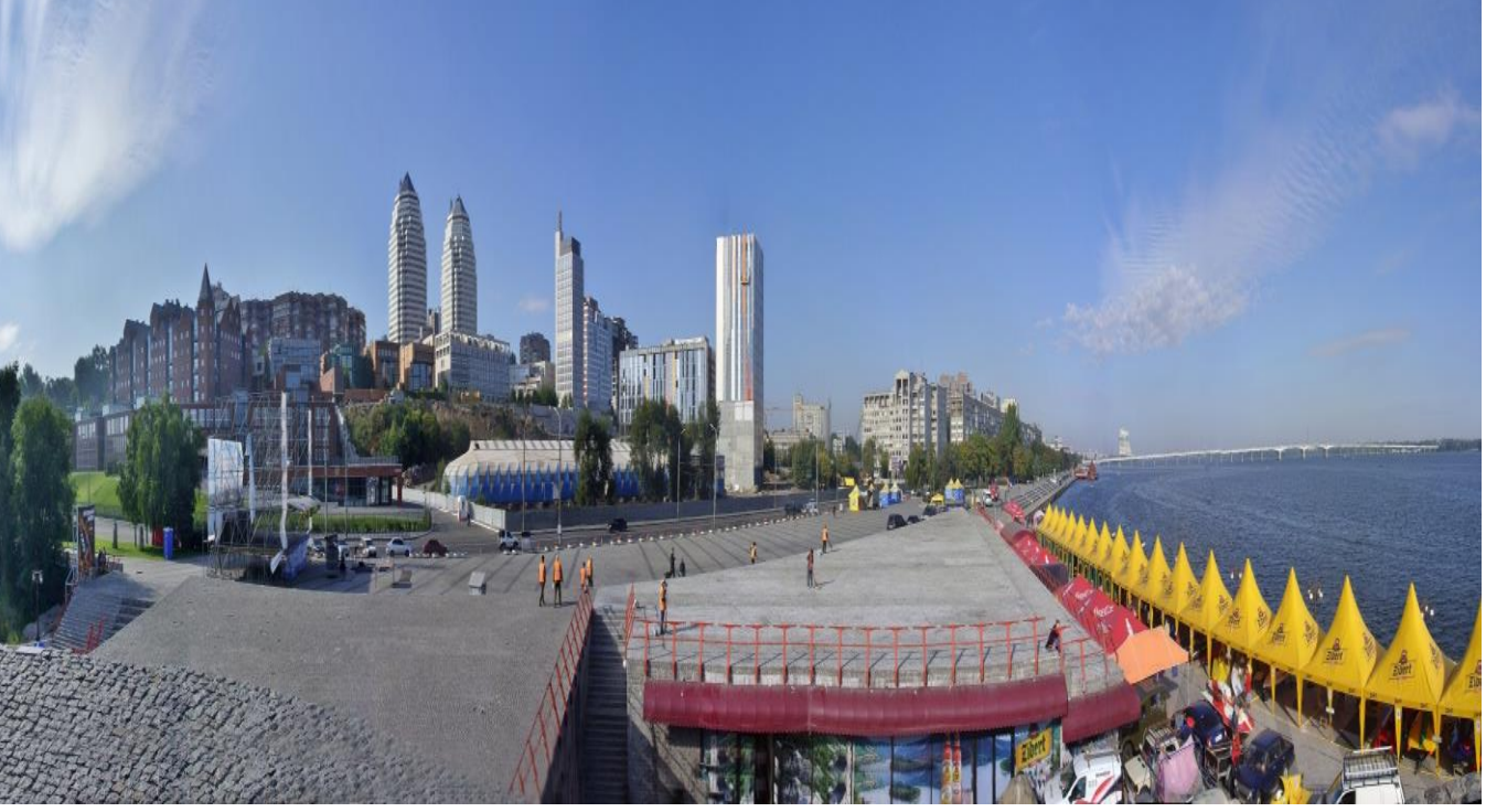
WELCOME to DNEPROPETROVSK!!!